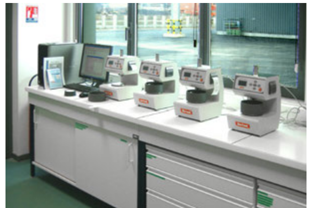
4 AUTOVICAT linked to PC via WinLect32 - VICATEST software

NOTE 1 .- According to standard EN 196-3 and EN 480-2, the results obtained by automatic methods should be compared with results obtained by the standard manual method. This requires having a manual Vicat apparatus and make necessary adjustments to validate the results.