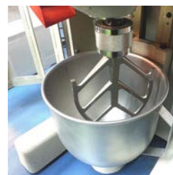
Bowl and paddle