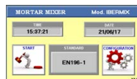
IBERMIX control module start screen