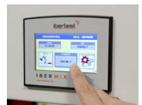
AP-43S electronic module with 4.3" touchscreen display