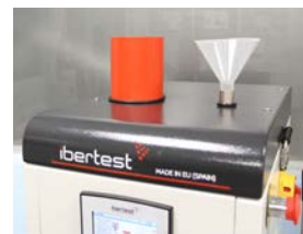
Automatic sand feeder and additive dispenser