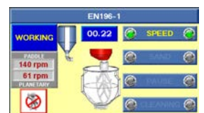
IBERMIX mixing screen according to standard

Bowl of about 5 litres capacity, entirely made of stainless steel, with two handles. The bowl is securely fixed on its support with a simple half-turn movement.